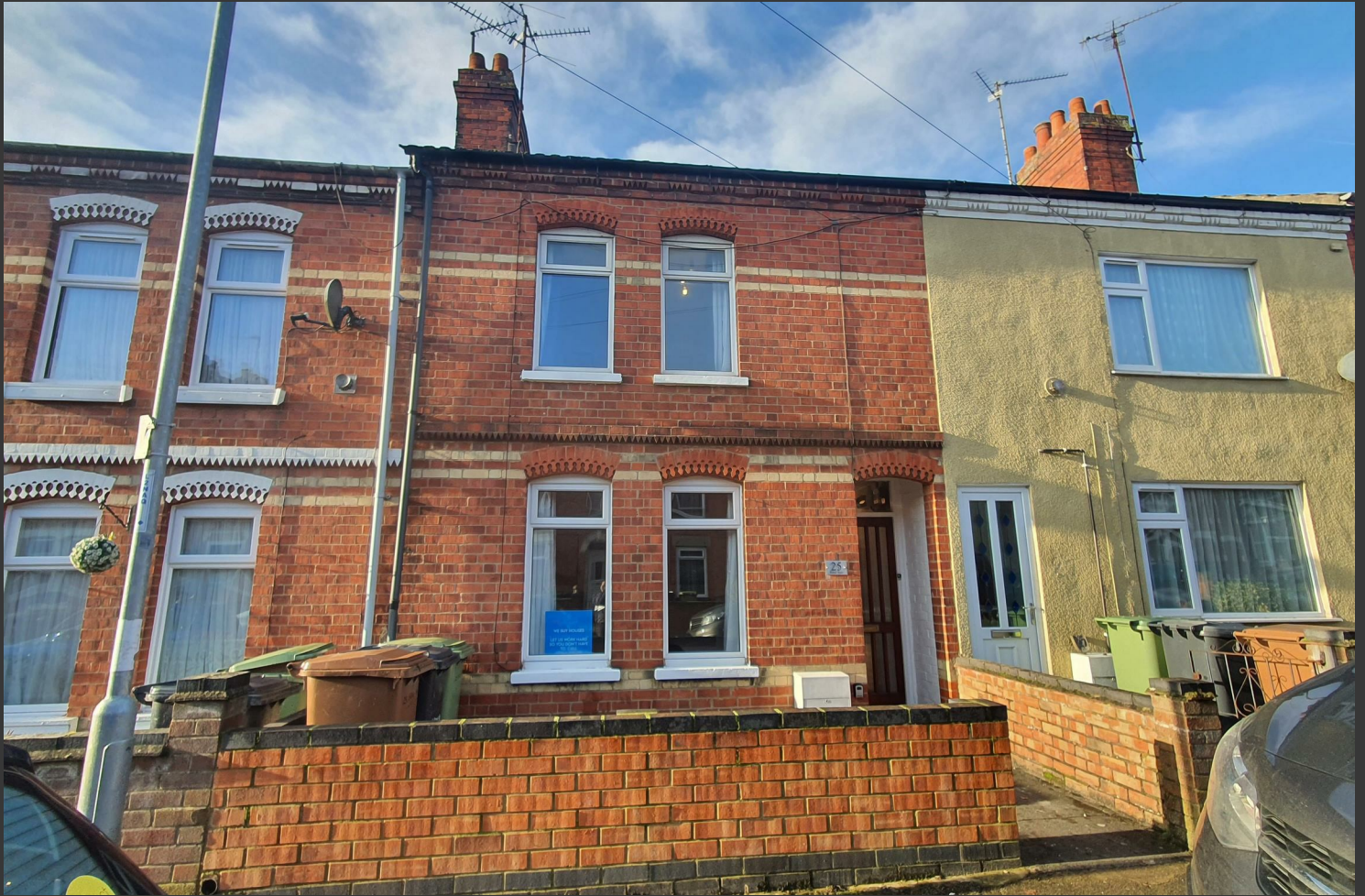
Bedale Road, Wellingborough NN8 4ER £525 PCM